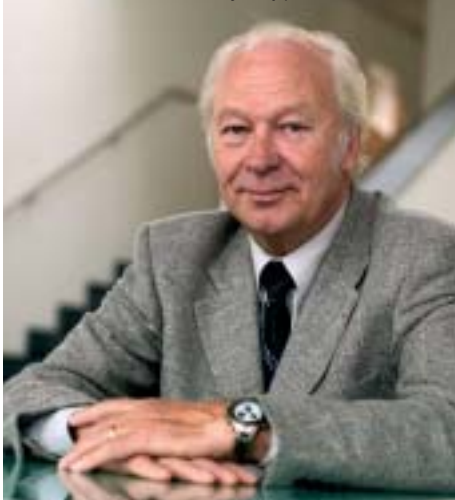
Aulis Sallinen