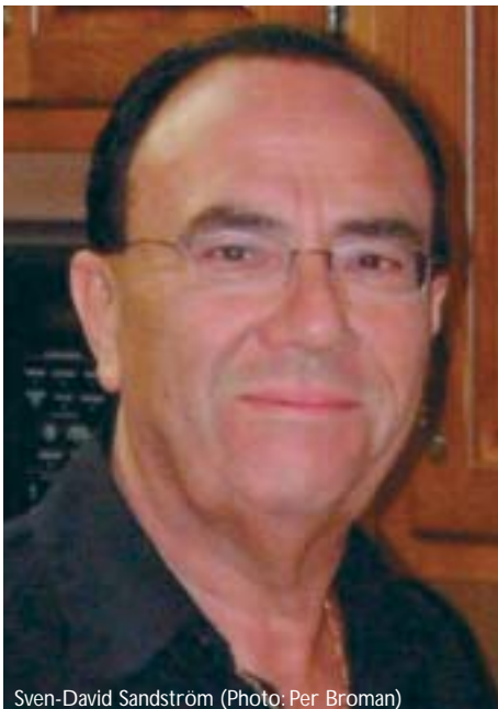
Sven-David Sandström

In the spring of 2003 Ingemar Månsson commissioned a work by Sandström for his new choir, the Lund Vocal Ensemble. Månsson proposed using the Bach motet "Singet dem Herrn ein neues Lied" as a model, an idea that appealed to Sandström. Like Bach's, Sandström's motet is written for a double chorus in three movements, although he uses an a cappella choir, rather than the continuo support common in Bach's motets. It is also highly virtuosic, utilizing rapid melismas and drawing on the interlocking room-acoustic effects possible when using the two choirs. Sandström expects the work to be performed with a Baroque feel. The often fast tempo and numerous melismas in the outer movements do not necessarily make the work harder. Singers have found that the fast tempi make the melismas easier to sing using glottal articulation and a lighter voice. The second movement is a romantic chorale juxtaposed with contrapuntal sections, somewhat similar to Bach's motet. The chorale itself is brilliant in its simplicity. It