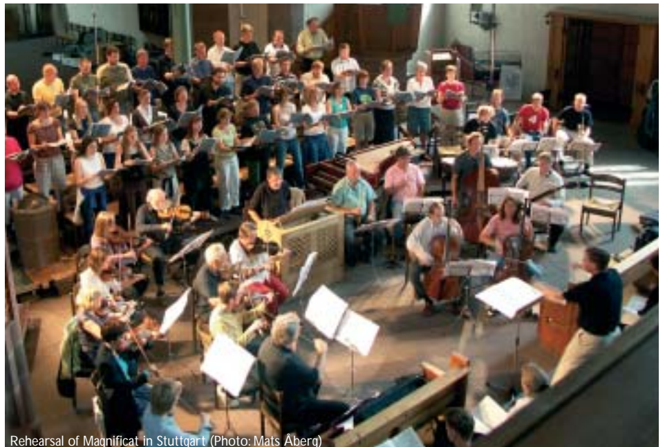
Rehearsal of Magnificat in Stuttgart